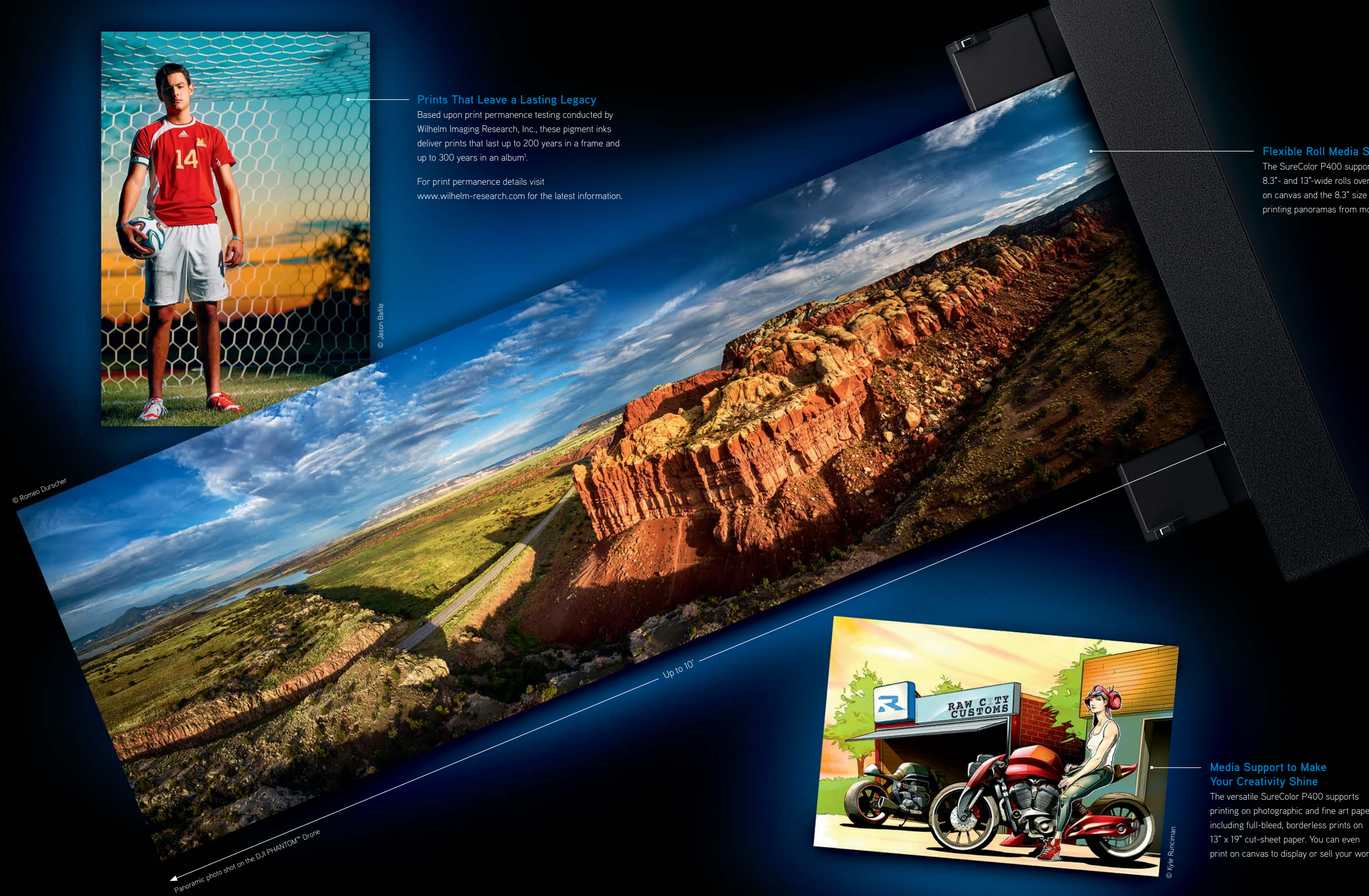
Up to 10'