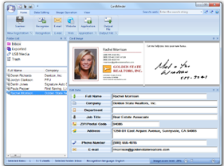
CardMinder for Windows® shown

Scan, store, and edit business card information with the bundled CardMinder software for Mac and PC and even export data into other applications like Address Book, Excel, and Salesforce.