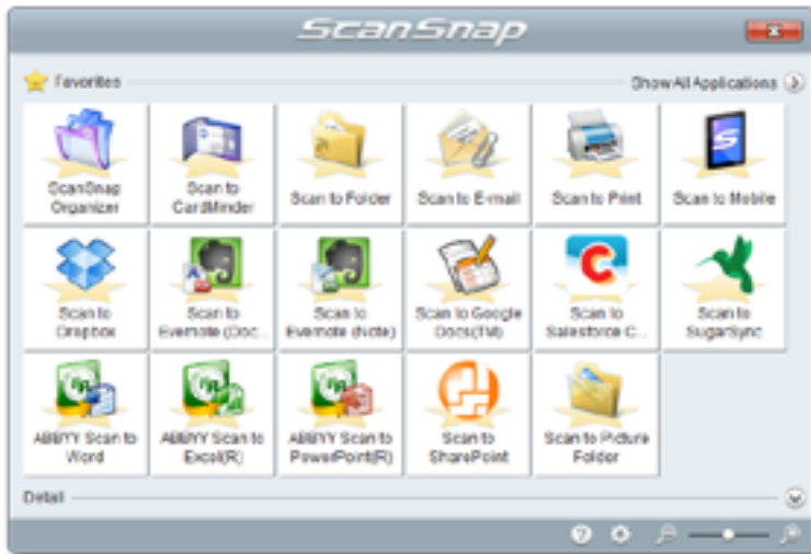
Quick Menu for Windows® shown

The ScanSnap Quick Menu for PC and Mac automatically pops up after scanning to provide you a variety of ways to be immediately productive with your scans. It can be easily customized to display just your favorites, present a recommendation, and even display custom profiles.